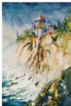
Break in the Weather