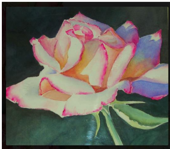
A Rose for Mom