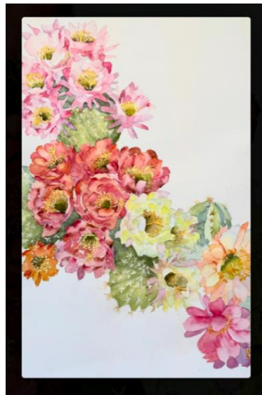
A Sunny Summer's Morning